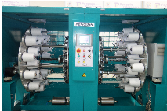
Knitting / Spiraler Head